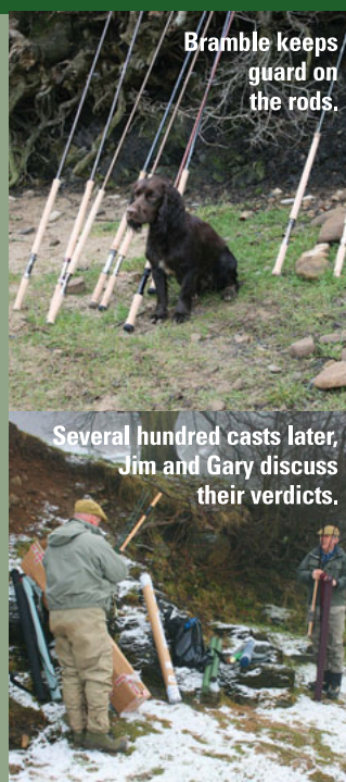
Bramble keeps guard on the rods.

Fifteen-foot salmon rods need to be versatile to meet different fishing situations while utilising a wide range of spey lines (from long-bellied floaters to short Skagits). I hope that we have taken some of the guesswork out of purchasing new tackle. Interestingly, the top rod is not the most expensive.